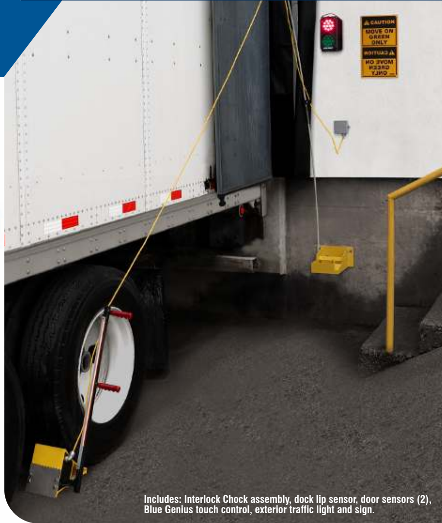
Includes: Interlock Chock assembly, dock lip sensor, door sensors (2), Blue Genius touch control, exterior traffic light and sign.