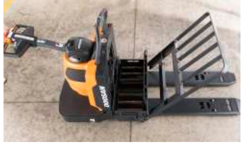
Battery Roller System is Standard Saves time and effort during battery