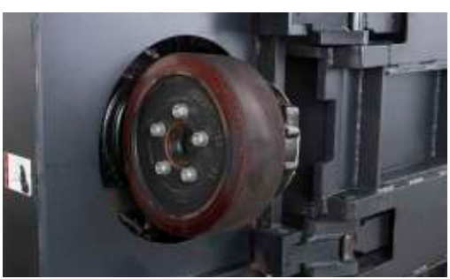
Heavy Duty Construction

Built for durability, these Rider Pallet Trucks contain 20% more structural steel than leading competitive models