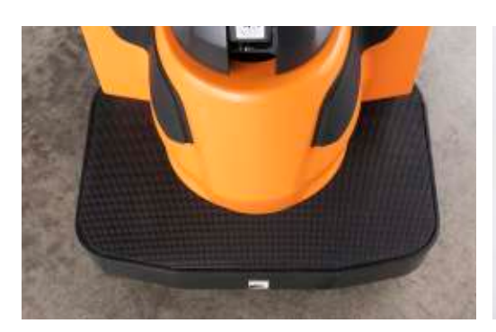
Large Operator Platform

Grease zerks at all pivot points make servicing easy and convenient, increasing up-time