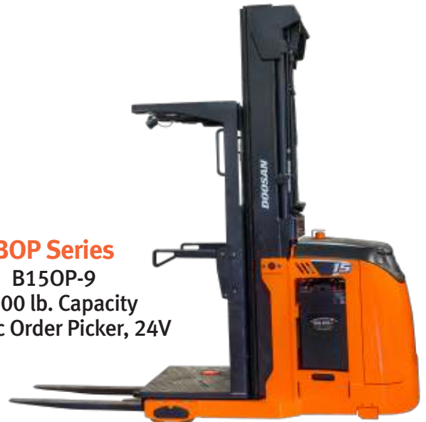
BOP Series B15OP-9 3,000 lb. Capacity Electric Order Picker, 24V