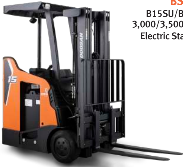
BSU Series B15SU/B18SU/B20SU-9 3,000/3,500/4,000 lb. Capacity Electric Stand-up Rider, 36V