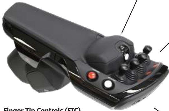
Finger-Tip Controls (FTC) (Optional)