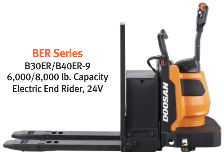
BER Series B30ER/B40ER-9 6,000/8,000 lb. Capacity Electric End Rider, 24V