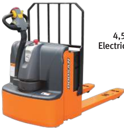
BW23S-7 4,500 lb. Capacity Electric Walkie Pallet, 24V