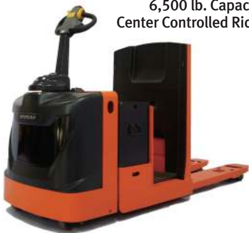
BWC33S-7 6,500 lb. Capacity Center Controlled Rider, 24V