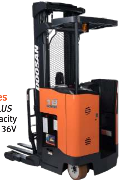
BR 7 PLUS Series BR18SP/20SP-7 PLUS 3,500/4,000 lb. Capacity Electric Reach Truck, 36V