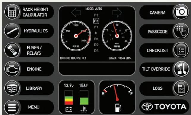
MD4 Display - High-Capacity Marina Forklift