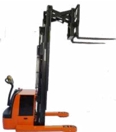
BWP17S-7 3,300 lb. Capacity Electric Walkie Reach, 24V