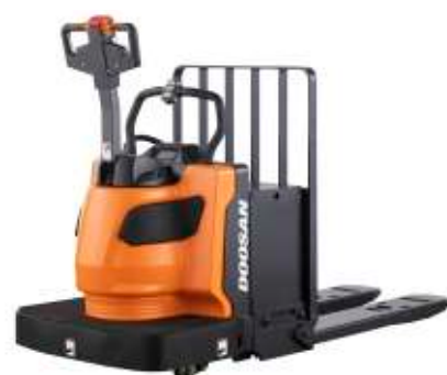
BER30-9/BER40-9 6,000/8,000 lb. Capacity Electric Rider Pallet Truck, 24V