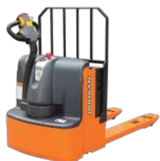
BW23S-7 4,500 lb. Capacity Electric Walkie Pallet, 24V