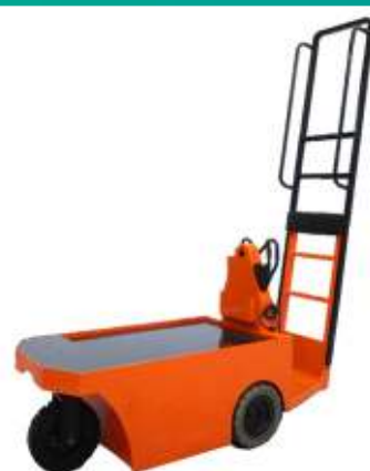
BSC05S-7 900 lb. Capacity Electric Stock Chaser, 24V