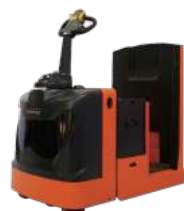
BWT45S-7 10,000 lb. Capacity Electric Tow Tractor, 24V