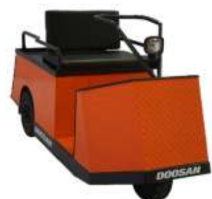
BUV03S-7 600 lb. Capacity Electric Personnel Carrier, 24V