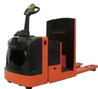
BWC33S-7 6,500 lb. Capacity Electric Rider Pallet, 24V