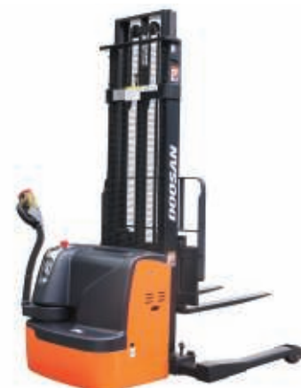
BWS17S-7 3,300 lb. Capacity Electric Walkie Stacker, 24V