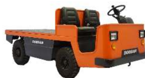
BBC23S/28S-7 4,400/6,600 lb. Capacity Electric Burden Carrier, 48V