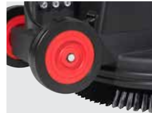
Large rear wheels facilitate transport and ensure good maneuverability