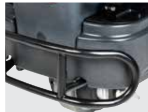
Standard front bumper protects the machine for longer life-time