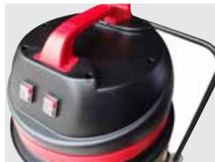
Easy handling due to ergonomic handle with cable hook and two separate on / off button