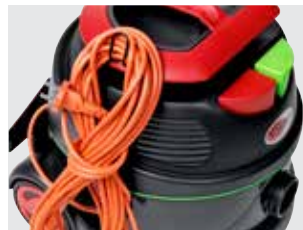
Cable holder for easy storage