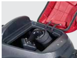
Large opening to the 73 liter recovery tank allows easy cleaning