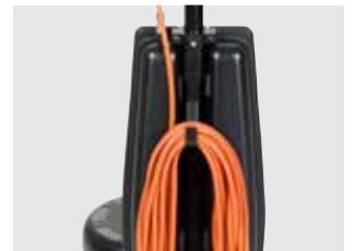
Robust metal hook for safe winding of the power cord and receiving the Leaf's ELLERS as storage