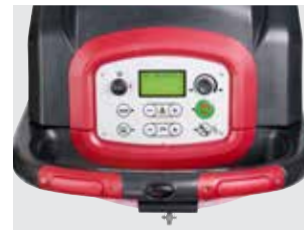
Intuitive control panel with LCD screen for all models (AS6690T/AS7690T pictured)