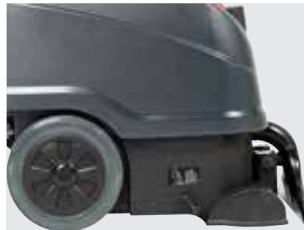
Large wheels for easy transport and maneuverability