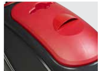
Simplified cleaning of the recovery tank, thanks to a large tank cover