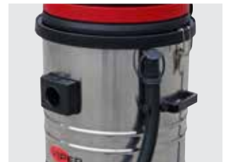
Drain hose for easy emptying of the container