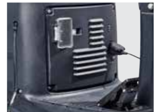
An integrated on-board charger enables easy plug-in and battery charge at any outlet