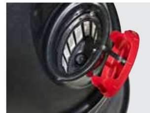
Water filling through large oval opening with filter and protective cover