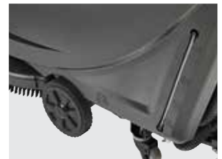
Easy to maneuver and transport: Big wheels and strong casters, making the machine well-balanced