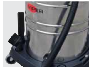
Easy storage of accessories