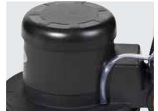
Triple planetary gear and quiet motor and gears