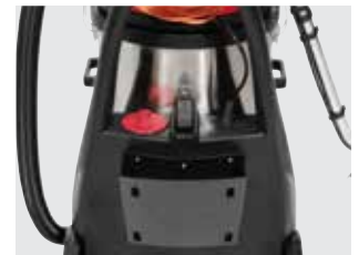
Fresh water tank integrated in the chassis.