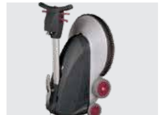
Space-saving storage in upright position. Large transport wheels for easy transport