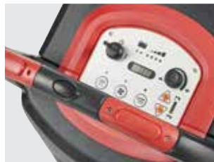
Control panel with intuitive display and buttons