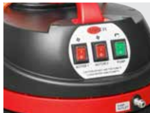
One-touch function elements for easy operation