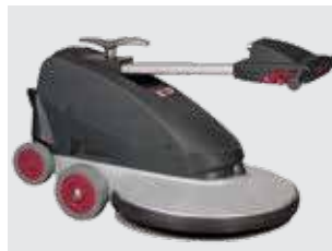
Folding handle for easy, space-saving storage and transportation of the vehicle