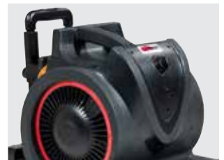
Handle for lightweight transportation