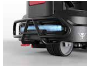
Sturdy bumper with high-visibility lights