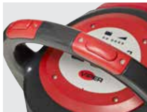
Ergonomically integrated safety switch. Each switch can be operated independently