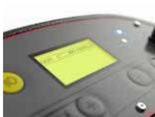
LCD heads-up display incl. hour meter