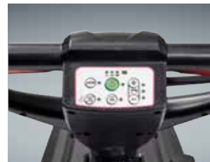
Intuitive control panel provides control over all functions (AS4325 model)