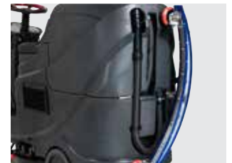
Built-in squeegee hanging system on recovery tank for easy machine transfer in narrow areas