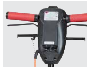
Ergonomic handle with height adjustment, safety switch and control lever for detergent tank