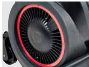
High quality air fan with filter protection