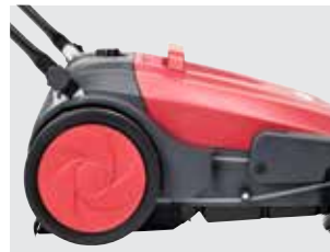
Large non marking wheel