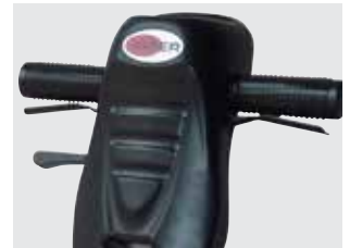
Ergonomically designed on handle and controls