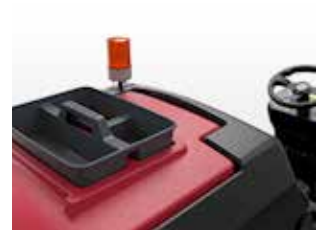
Easy-access debris tray