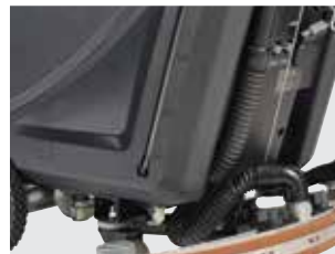
Water level indicator with volume visible on the tank