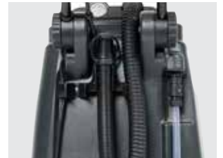
Drain hose for easy emptying