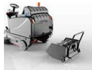
Wheeled hopper with optional mini containers