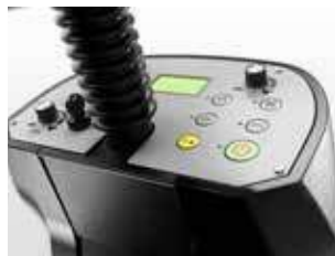
One touch start activates all main functions