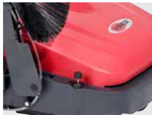
Side brooms can individual be adjusted just by turning a knob