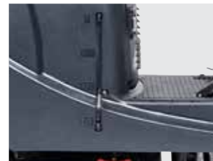
Water solution level indicator with volume visible on the tank