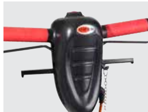
Ergonomic handle, adjustable in height, central safety button, control lever for detergent tank