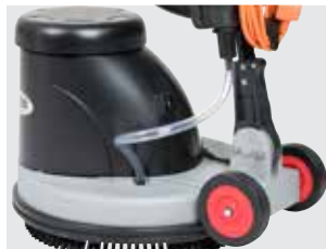
Powerful, rugged engine and large rear wheels for easy transport