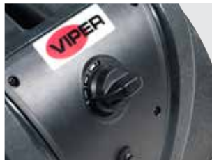
3-speed induction motor with reduced power consumption