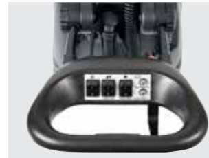
Ergonomic and adjustable handle