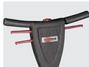
Ergonomically designed handle with height adjustment, center type safety switch and easy to use function lever