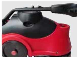
Foldable handle for easy storage