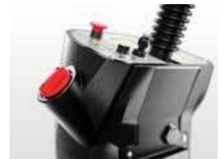
Remove the red cap and fill the solution tank with fresh water