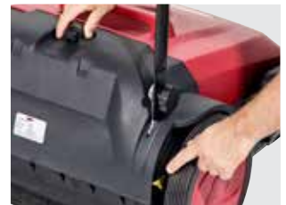
Adjustable main brush