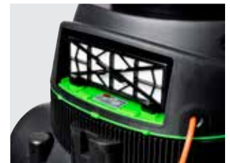
HEPA filter comes as standard