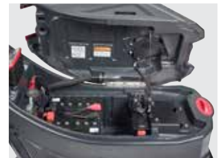
Recovery tank with hand grip for easy tilting