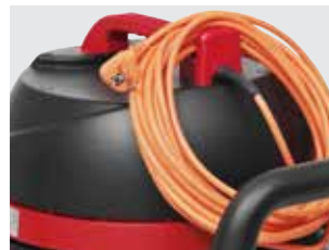
Cable holder for easy storage