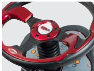
Intuitive dashboard, one touch button and userfriendly menu for operation settings