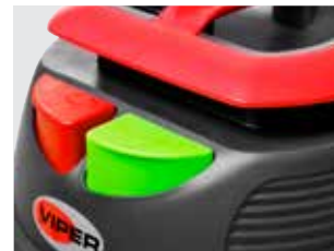
ECO button to adjust the suction power and reduce the noise