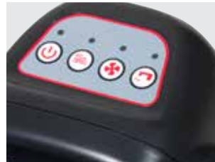
Easy to use control panel with four main functions