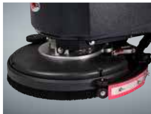
Tool-free removal and assembly of squeegee simplifies maintenance