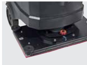
Orbital scrubber for floor cleaning or coat stripping (AS7190TO)