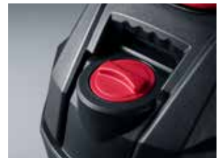
Convenient front access to solution tank for quick refills